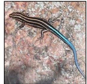
Five Lined Skink

A management planning process is underway to inform the long term direction for the park.